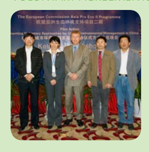
XI'AN VOLUNTARY AGREEMENTS IN XI'AN

Xi'an has developed to a place of technical, educational, industrial and commercial centre in the Mid-Western Region of China and is rich in tourism resources. Compared with the other regions involved in the VA2 project, Xi'an has especially been successful in reaching out to private enterprises. Private sector participation is crucial for Xian's development as a National Environmental Protection Model City. Thus Xi'an Environmental Protection Bureau has intensified its co-operations with private companies by adopting voluntary environmental management approaches. Xi'an Environmen-