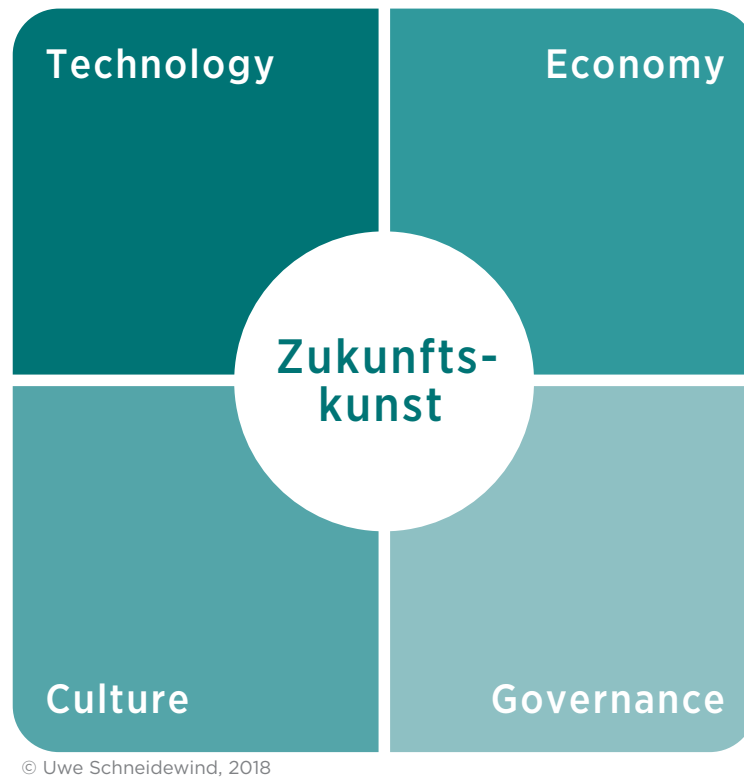
Fig. 1: The four dimensions of “Zukunftskunst” as a guideline for shaping the future in the Corona crisis 1